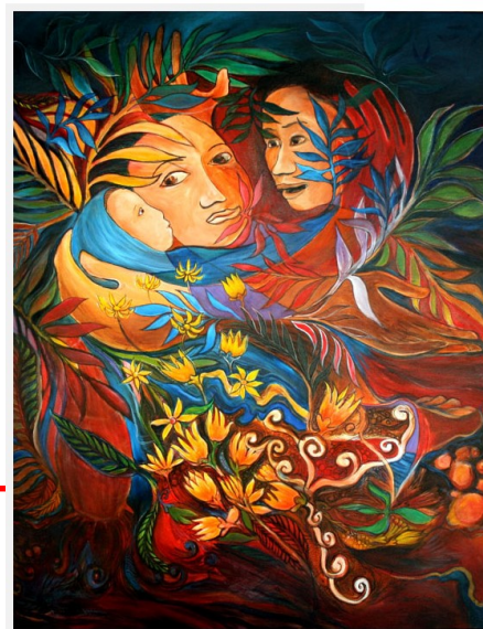
Erlend Sibuea, Nativity , 2008. Acrylic on canvas, 31 x 23.6 cm.