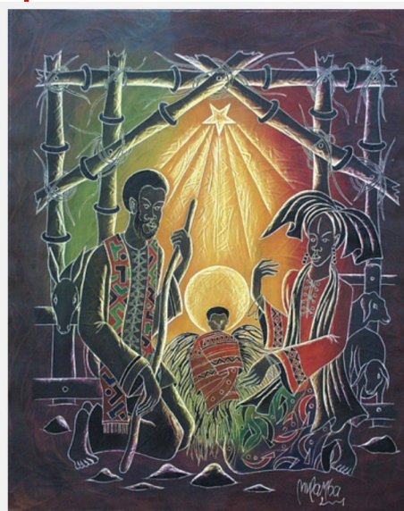
Joseph Mulamba-Mandangi, Nativity , 2001. Peinture grattée, 70 x 50 cm.